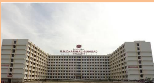
RMD Sinhgad School of Management Studies Campus, Warje, Pune