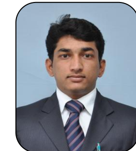
Suryakant Parade Indusind Bank